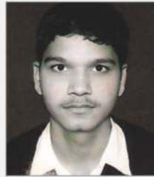
Ravi UPSEE-06 (AF)