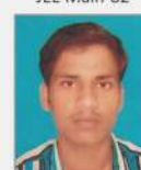
Vivek Vihar JEE Main-130